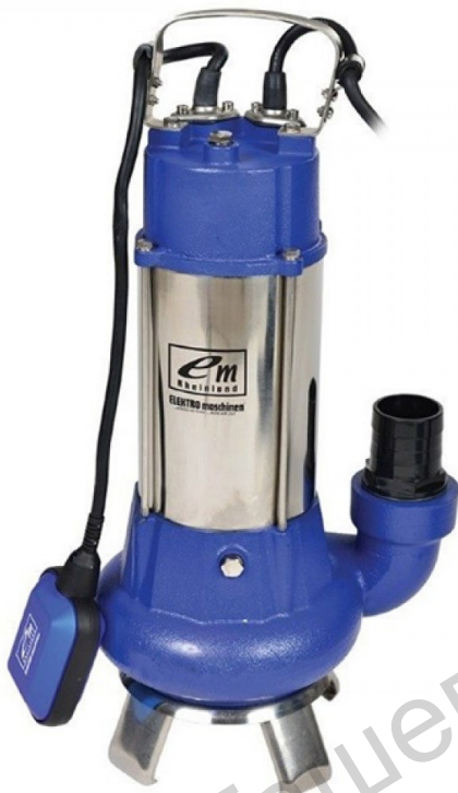
SPG 20502 DR